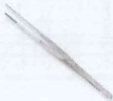
d. Stainless Straight Forceps, long thin end (25cm)