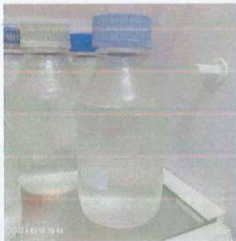
b. Culture Media Bottle 500 ml (blue cap)