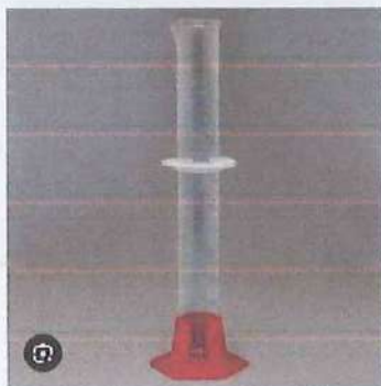
c. Graduated Cylinder, pyrex, 100ml