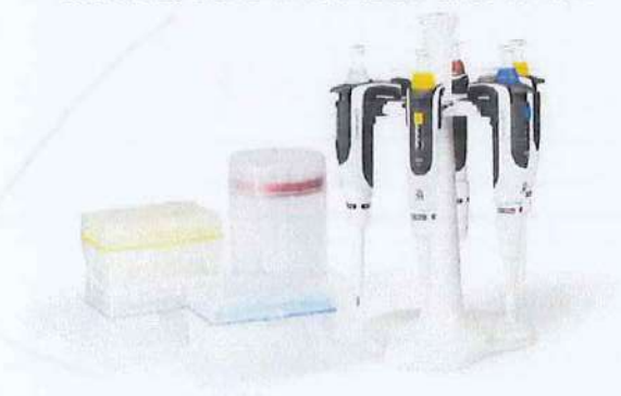
g. Pipettor Sets (P2.5, P10, P100, P200, P1000)