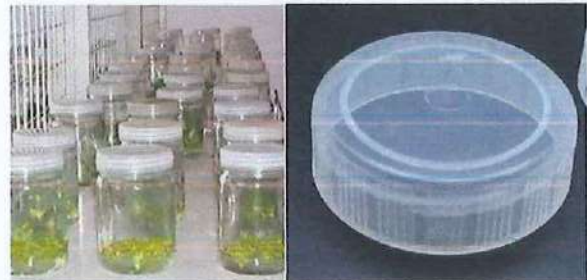
f. Tissue culture bottle caps or phyto caps (autoclavable, white, high temperature resistant cap), suitable for 240 to 650 ml tissue culture bottles