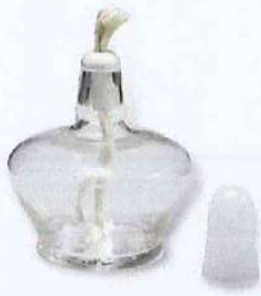
a. Alcohol lamp (big size, 250ml)